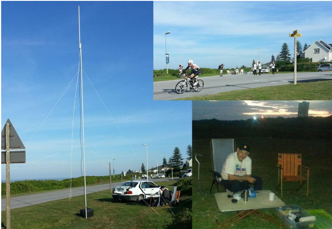
Ironman 2013.

This Newsletter is published by the Port Elizabeth Amateur Radio Society P.O. Box 10402, LINTON GRANGE, 6015