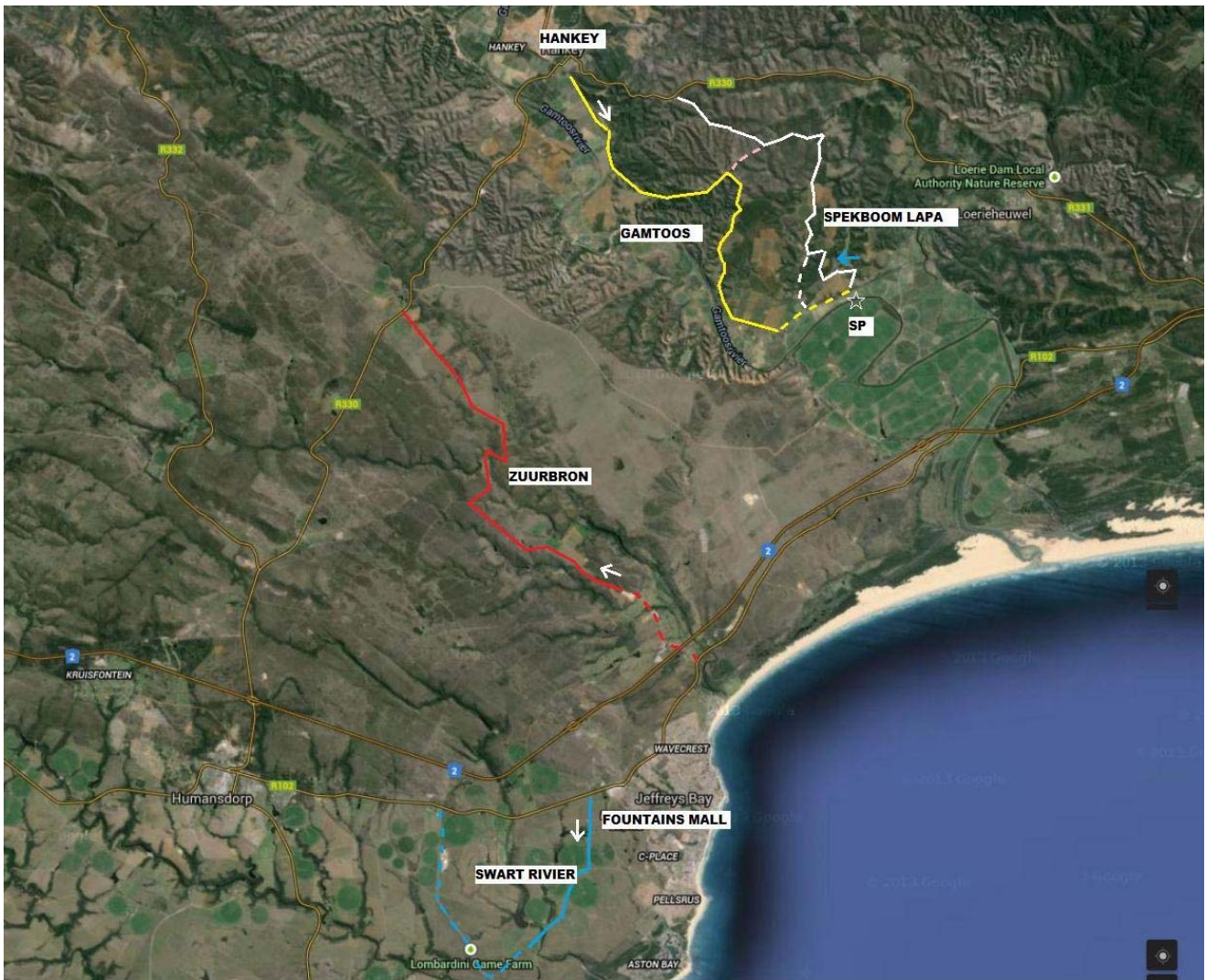
Fountains Mall Rally – November 2014 (see page 3)